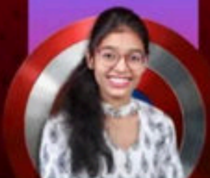
Princi Khemasara Plus Learner