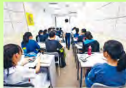
FACE TO FACE