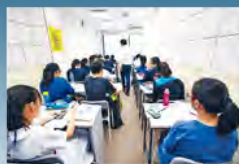
FACE TO FACE